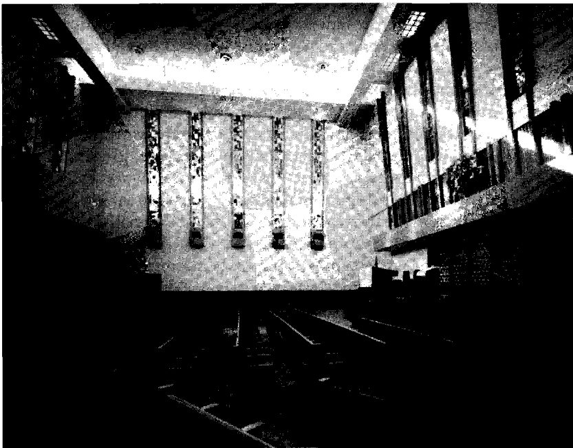
Congregation Adath Israel after the introduction of mixed seating.

the other side of the first floor of the Synagogue without any curtain or any partition between them.” 83 In 1923, apparently in reaction to liberalization moves in many Conservative synagogues, members voted an amendment to their constitution: “that no family pews be established nor may men remove their hats during services; that no organ be used during services; that no female choir be permitted so long as ten (10) members in good standing object thereto.” 84