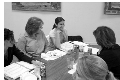
DeLeT fellows and their mentor teachers enjoy a meal as they begin their year of work together at the first Summer Institute.