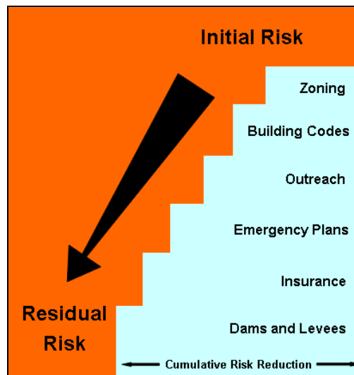
Figure 2. Multiple Tools Available To Reduce Flood Risk