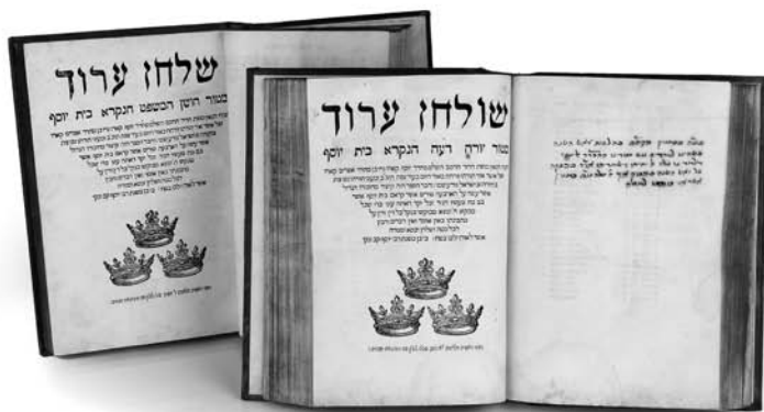
Joseph Karo, Shulchan Aruch. First Edition. Venice, 1565 Recently Sold at Auction for $180,000.

Auctioneers of Rare Books, Manuscripts and Fine Art