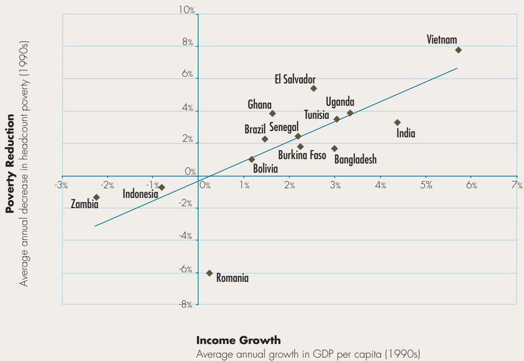
Figure 1: Growth and Poverty Reduction: Not a Simple Relationship