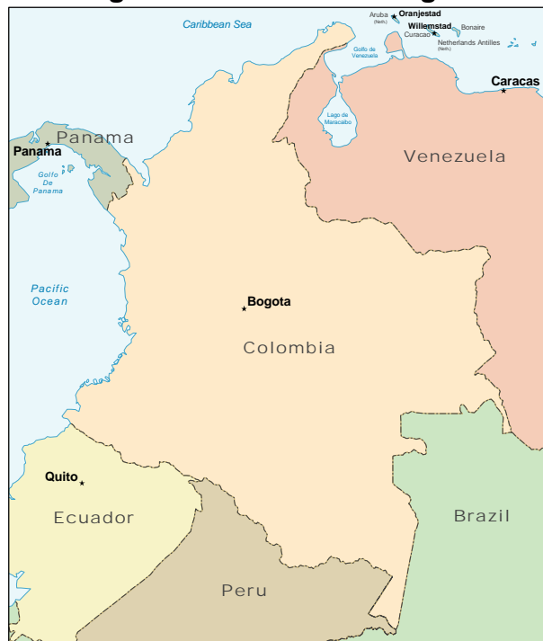
Figure 3. The Andean Region