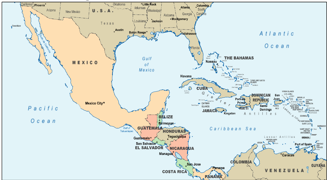
Figure 5. Mexico and Central America