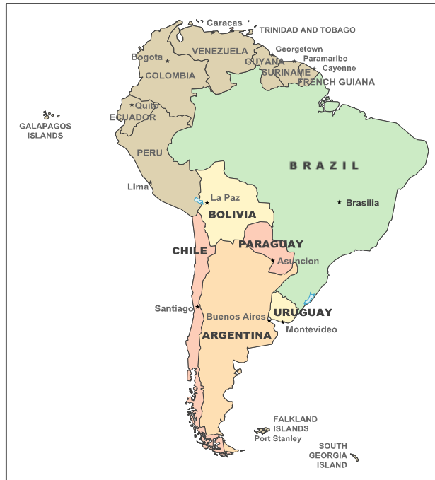
Figure 4. South America