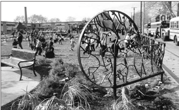
Orchard Schoolyard: after

Cleveland's 82 elementary schools serve more than 45,000 students ages 4-13. Yet the majority lack appropriate playgrounds, and 75 percent have no such facilities within a quarter-mile radius. Acknowledging the urgent need for safe places for kids to play, Cleveland Mayor Michael R. White sought the help of Parkworks, a local organization dedicated to building community through park and greenspace development.