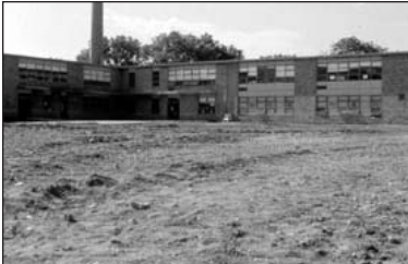
Orchard Schoolyard: before