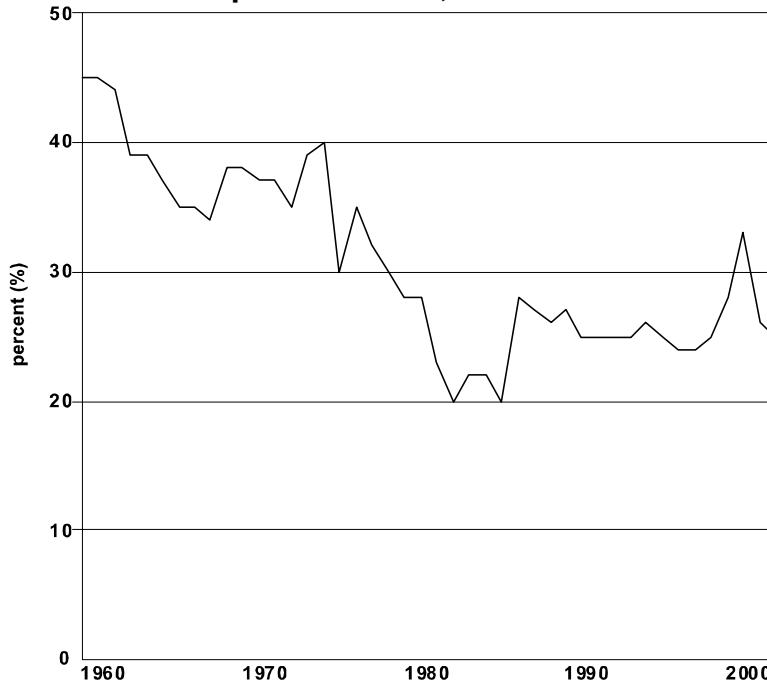
Figure 3. Average Effective Corporate Tax Rates: Federal Corporate Taxes as a Percentage of Corporate Profits, 1959-2000