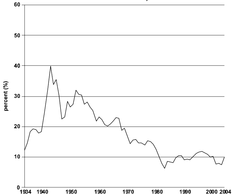
Figure 2. Corporate Tax Revenue as a Percentage of Total Federal Tax Revenue, FY1934-FY2004