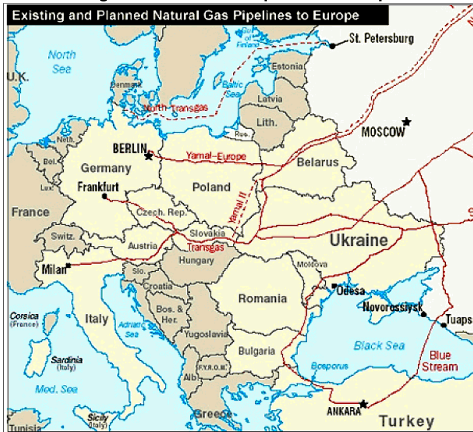
Figure 5. Natural Gas Pipelines to Europe