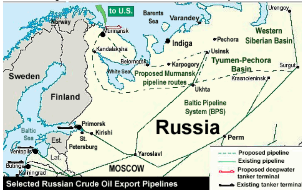
Figure 3. Selected Northwestern Oil Pipelines