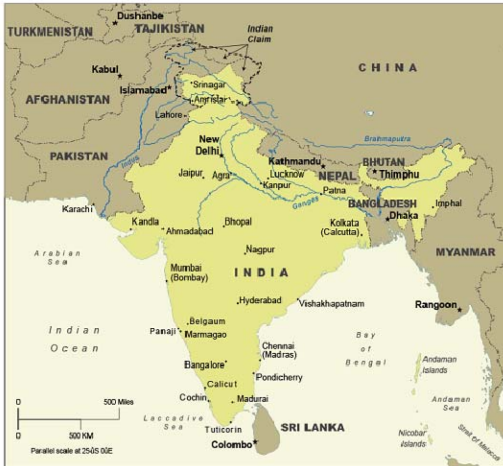
Figure 2. Map of India

Source: Map Resources. Adapted by CRS. (2/2007)