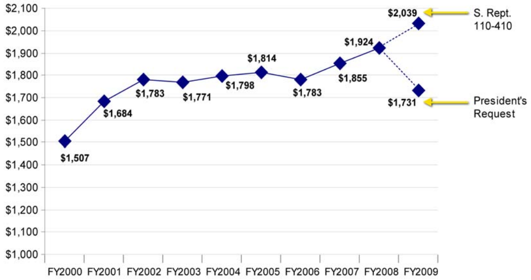
Figure 2. Funding for Older Americans Act Programs, FY2000-FY2008, and FY2009 Proposals ($ in millions)