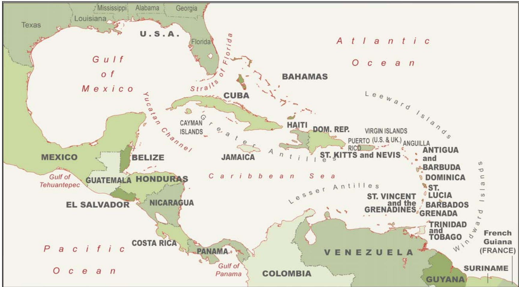
Figure 1. Map of the Caribbean Basin