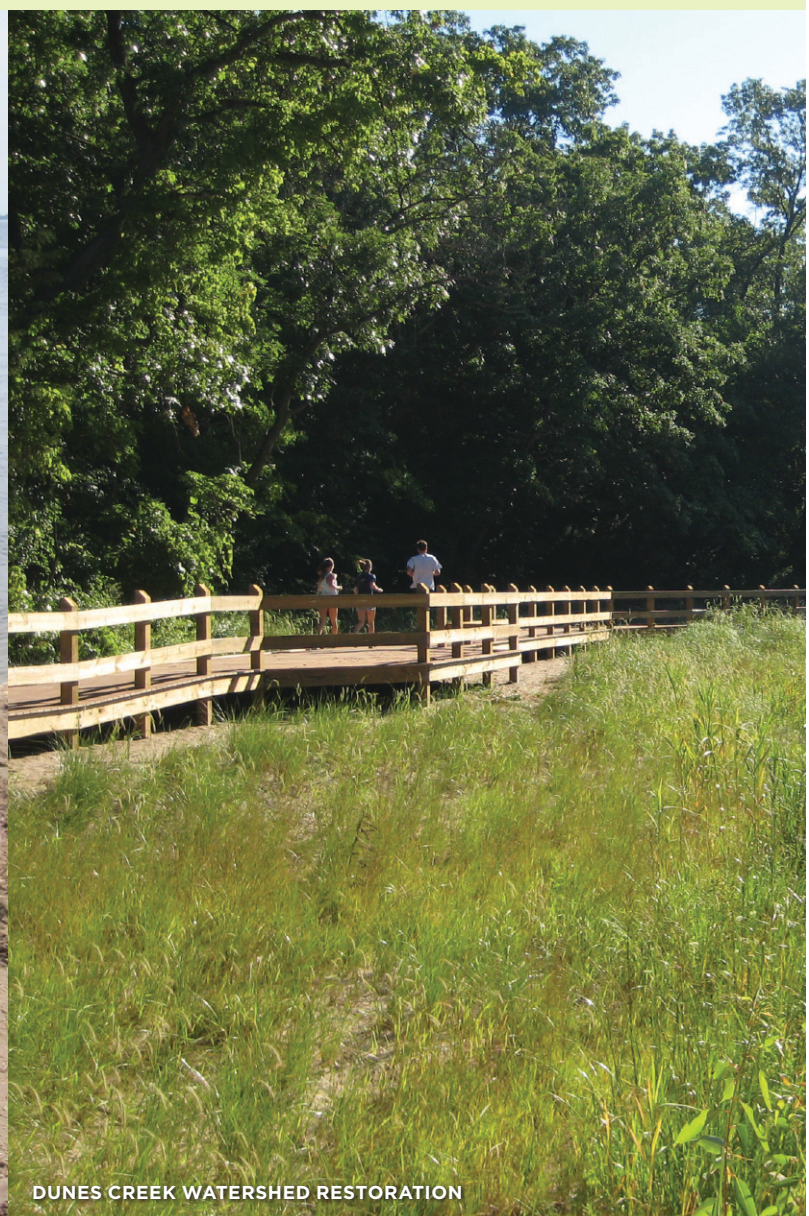
DUNES CREEK WATERSHED RESTORATION