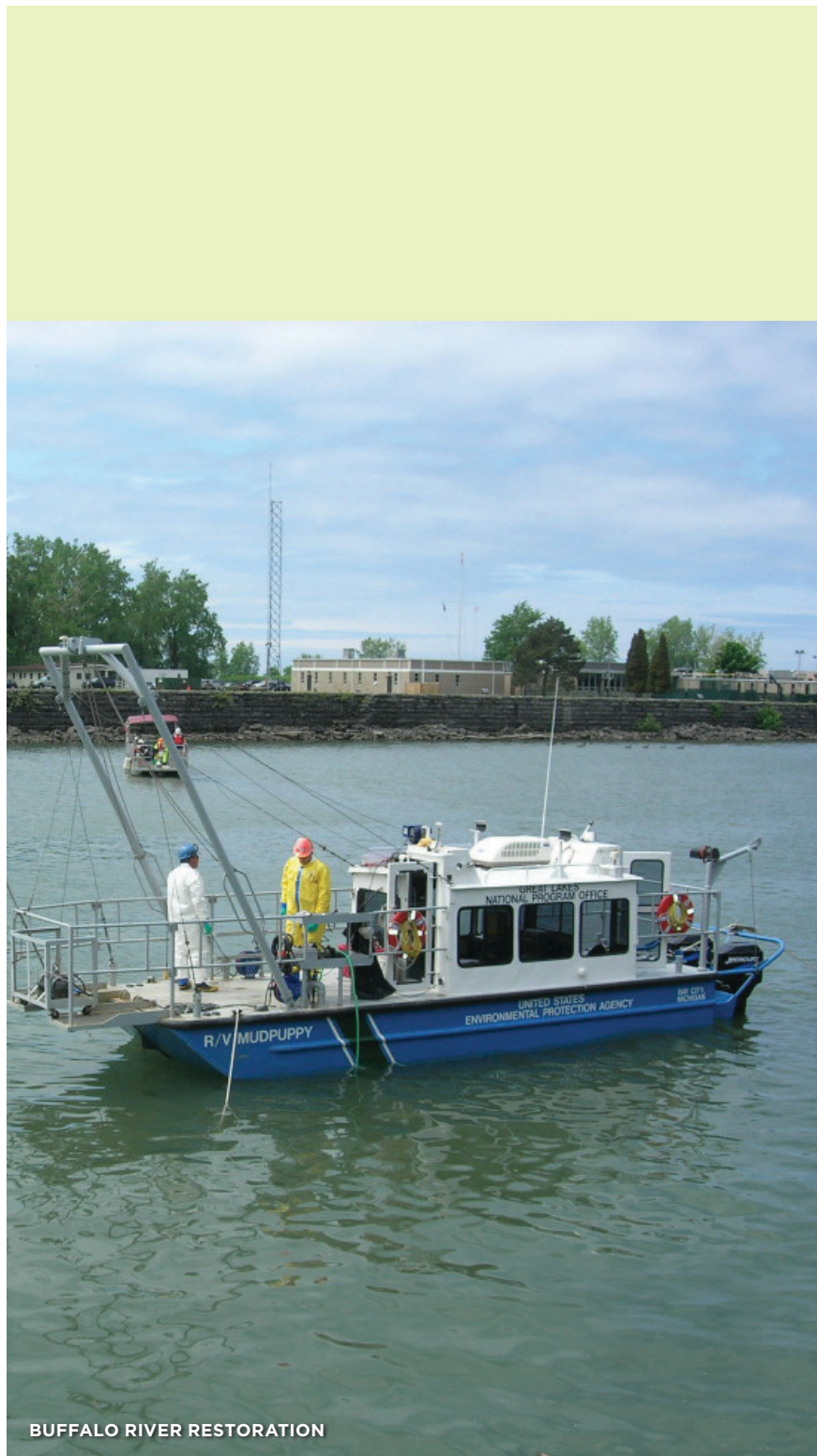
BUFFALO RIVER RESTORATION

(Cover) Muskegon Lake Shoreline Restoration; Dunes Creek Watershed Restoration (This page) Buffalo River Restoration