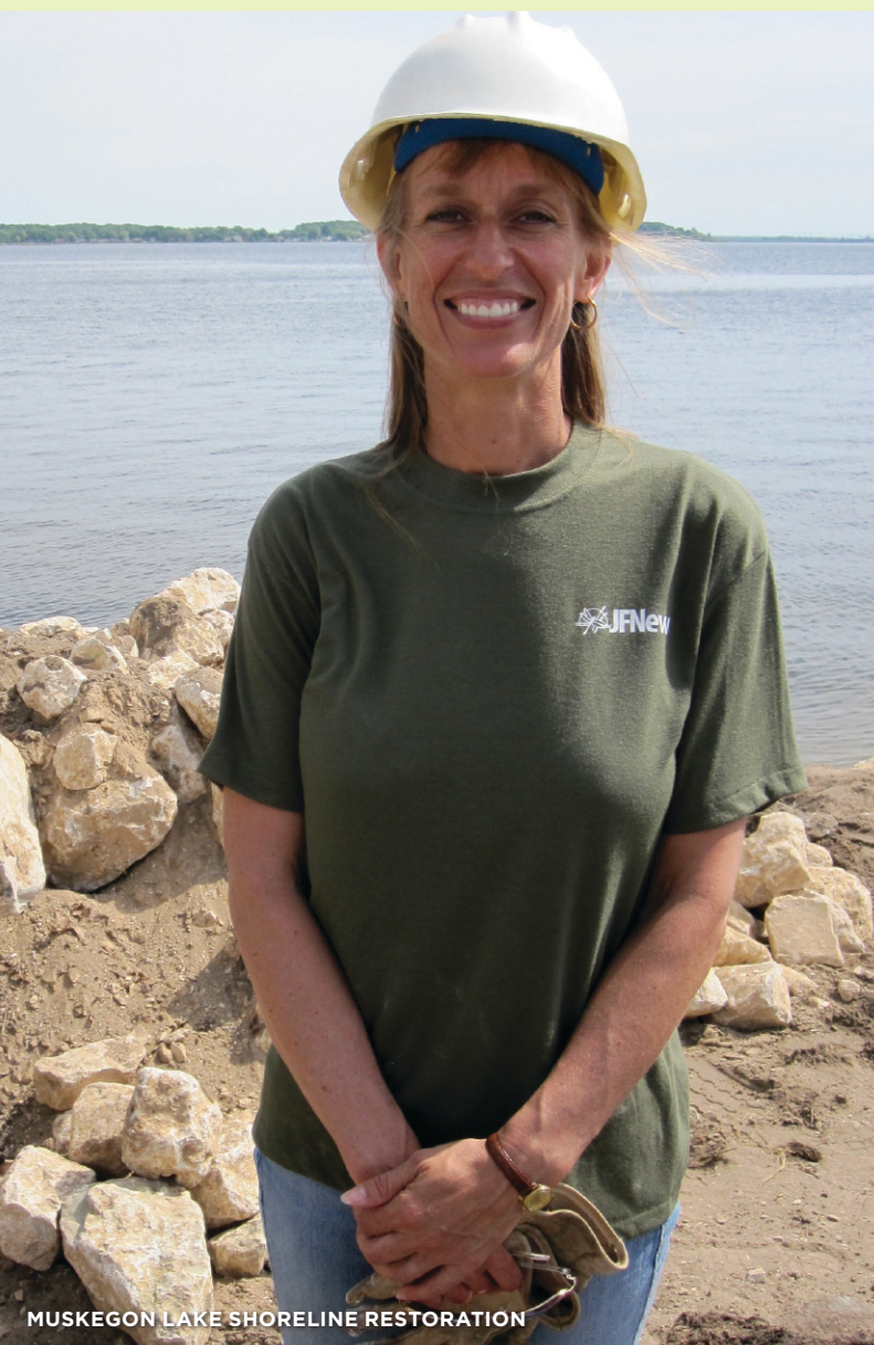
MUSKEGON LAKE SHORELINE RESTORATION

PEOPLE WORKING TO RESTORE THE GREAT LAKES