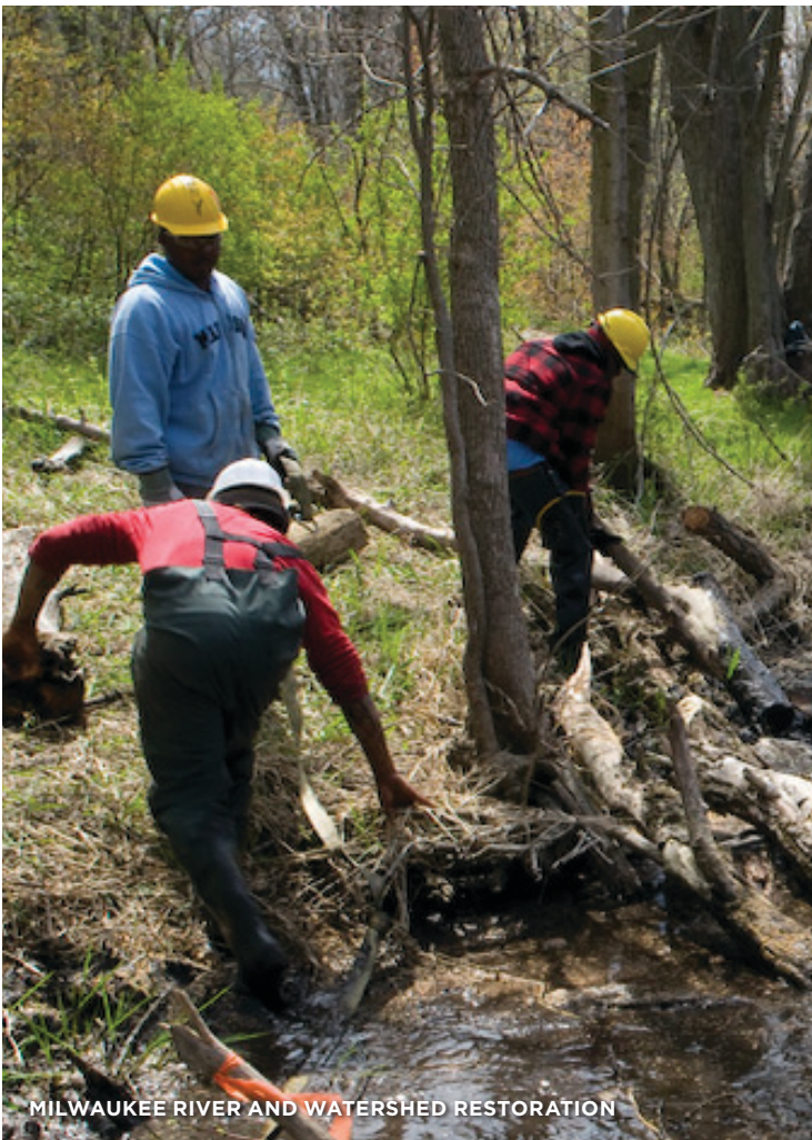
MILWAUKEE RIVER AND WATERSHED RESTORATION

The project prompted a retired doctor, who was a Muskegon native, to donate $4 million to support ongoing efforts to heal the lake. The gift from the doctor, who wished to remain anonymous, was the largest donation ever given to the Community Foundation for Muskegon County.